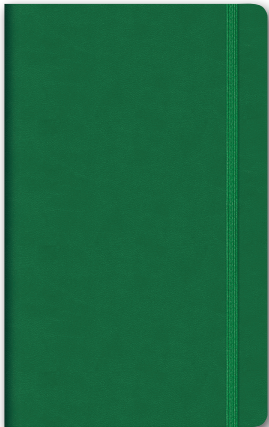
design ref: HB Tucson Smart

soft touch cut flush tucson cover with coordinating closure band, the perfect platform for creative branding.