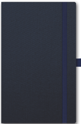
design ref: 8V Oceano

oceano is reinvented from water bottles to create a luxurious textile cover with recycled paper pages to enhance the eco credentials.